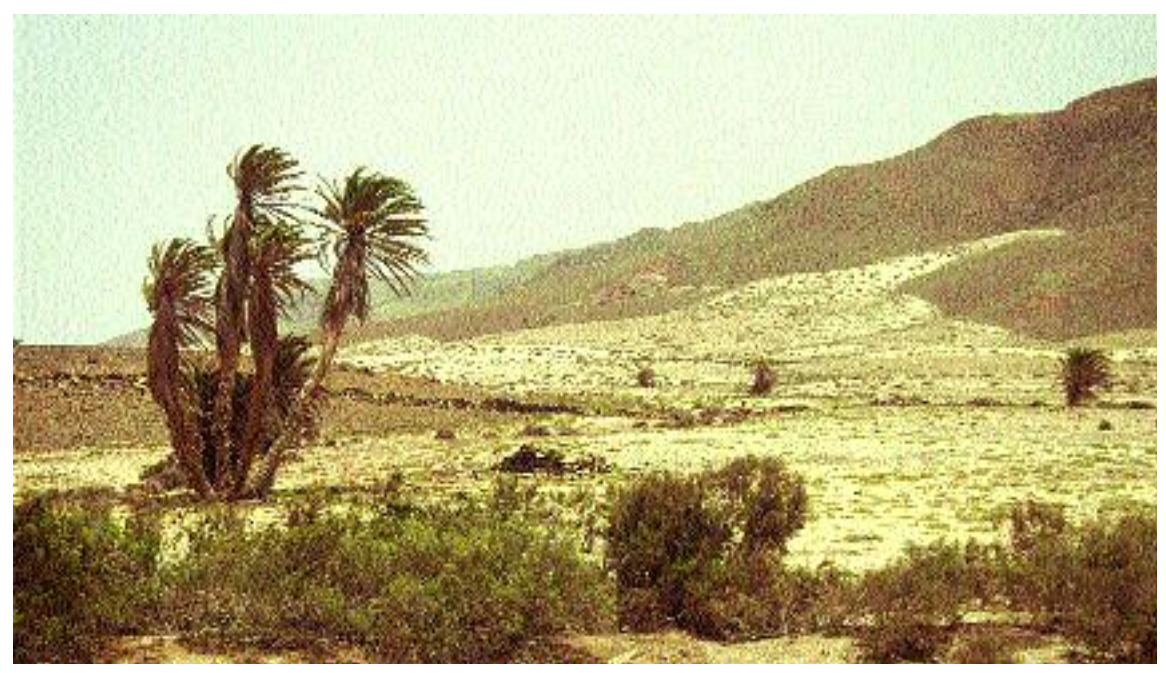
8. A clustering adult Phoenix growing in the interior of Boavista. Other individuals established in the dry stream-beds, can be seen in the background. Tamarix canariensis grows the foreground.

more reminiscent of 19th century industrial Britain than of anything we had seen so far on the other islands. The salinãs themselves are set within the adjacent crater, reached by a tunnel carved through the crater wall. The tunnel is found by following the cables and wooden pylons of the old tramway that was used at the peak of the production to transport salt from the crater to the port at the village. Today, one passes through the mountain to the salinãs to find a surprisingly silent and beautiful place, with regularly-spaced rectangular ponds of pink, blue and white. The rusting machinery and rotting buildings remain, the pulleys and tram-carts still visible, as if the whole industry was stopped short and abandoned suddenly before the end of a day's work.